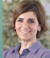
Elisabetta Iossa Commissioner at the AGCM Italy